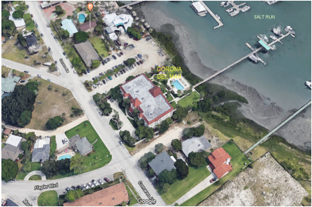
Built in 2000 - 15 units - 3 floors