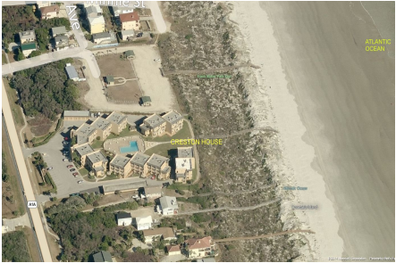
Built in 1973 - 60 units - 3 floors

Creston House Condominium Association Office # 904-471-0825 Fax # 904-471-0871 Emergency # 904-471-6606 https://crestonhouse.wordpress.com/