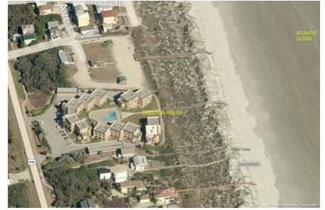
Built in 1973 - 60 units - 3 floors

Creston House Condominium Association Office # 904-471-0825 Fax # 904-471-0871 Emergency # 904-471-6606 https://crestonhouse.wordpress.com/