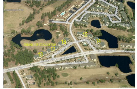
Built in 2004 - 68 units - 2 floors

Number of units: 64 Number of active listings for rent: 0 Number of active listings for sale: 0 Building inventory for sale: Number of sales over the last 12 months: 0% Number of sales over the last 6 months: 0 Number of sales over the last 3 months: 0