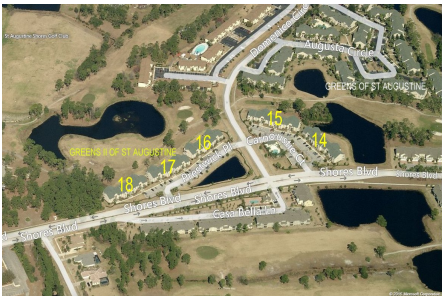
Built in 2004 - 68 units - 2 floors