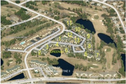
Built in 1998 - 170 units - 2 floors

The Greens Of St. Augustine Condominium Association, Inc.