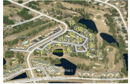
Built in 1998 - 170 units - 2 floors

The Greens Of St. Augustine Condominium Association, Inc.