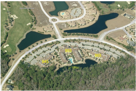
Built in 2004 - 149 units - 3 floors

Laterra Condominium Association Inc 965 Registry Blvd, Saint Augustine, FL 32092 (904) 940-5183 Laterra Condominium Complex Address: 955 Registry Blvd, St Augustine, FL 32092, (904) 940-5684