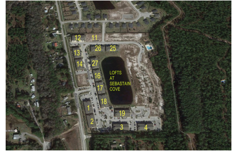
Built in 2008 - 200 units - 2 floors

SEBASTIAN COVE HOMEOWNERS ASSOCIATION, INC 2806 N 5TH ST STE 403 ST AUGUSTINE FL 32084 PHONE 813-933-5571