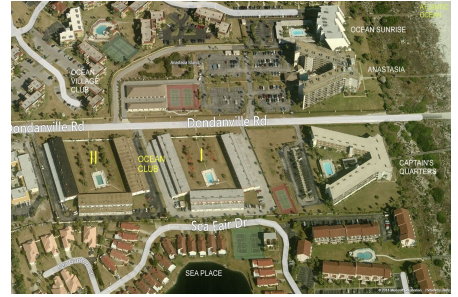
Built in 1984 - 86 units - 2 floors

Ocean Club Association II Coastal Realty & Property Management 3942 A1A South, St Augustine, FL 32080 904-471-6606 ext. 309 http://oceanclub2.wordpress.com/