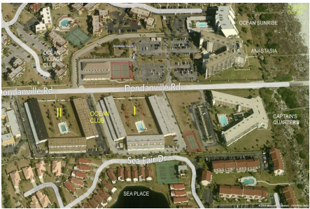
Built in 1984 - 86 units - 2 floors

Ocean Club Association II Coastal Realty & Property Management 3942 A1A South, St Augustine, FL 32080 904-471-6606 ext. 309 http://oceanclub2.wordpress.com/