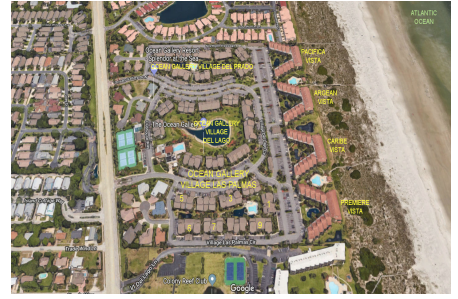
Built in 1982 - 73 units - 3 floors

Ocean Gallery Property Management, 4600 A1A South, St. Augustine, FL 32080, 904-471-6655 https://oceangalleryprop.com/the-village-las-palmas-condominium-association-inc-m