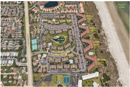
Built in 1982 - 73 units - 3 floors

Ocean Gallery Property Management, 4600 A1A South, St. Augustine, FL 32080, 904-471-6655 https://oceangalleryprop.com/the-village-las-palmas-condominium-association-inc-m