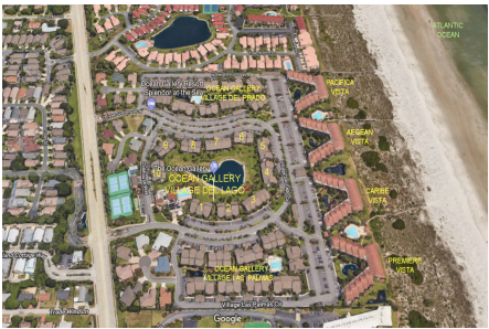
Built in 1982 - 82 units - 3 floors

Ocean Gallery Property Management, 4600 A1A South, St. Augustine, FL 32080, 904-471-6655 https://oceangalleryprop.com/the-village-del-lago-condominium-association-inc-mi