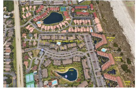
Built in 1985 - 83 units - 3 floors

Ocean Gallery Property Management, 4600 A1A South, St. Augustine, FL 32080, 904-471-6655 https://oceangalleryprop.com/the-village-del-prado-condominium-association-inc-m