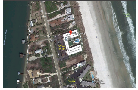
Built in 1974 - 63 units - 3 floors

Ocean House Condominium 7870 A1A South St. Augustine, FL 32080 Office: (904) 471-0454