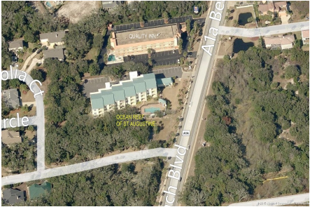
Built in 2008 - 18 units - 3 floors

OCEAN REEF OF ST. AUGUSTINE HOMEOWNERS ASSOCIATION, INC. PREMIER PROPERTIES REALTY GROUP INC. ADDRESS 661 AIA BEACH BLVD ST AUGUSTINE FL32080 PHONE 904-471-5000