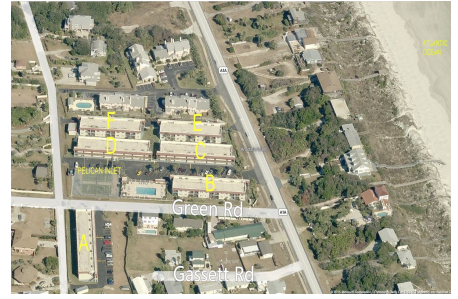
Built in 1975 - 82 units - 2 floors

Address: 7175 A1A S, St. Augustine, FL 32080 Phone: 904-471-0434