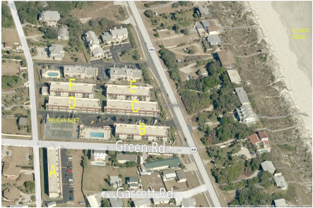
Built in 1975 - 82 units - 2 floors

Address: 7175 A1A S, St. Augustine, FL 32080 Phone: 904-471-0434