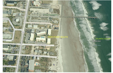
Built in 1982 - 64 units - 3 floors

Pier Point South Condominium Address: 390 A1A Beach Blvd, St Augustine, FL 32080, Phone:(904) 471-3622