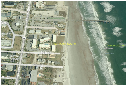
Built in 1982 - 64 units - 3 floors

Pier Point South Condominium Address: 390 A1A Beach Blvd, St Augustine, FL 32080, Phone:(904) 471-3622