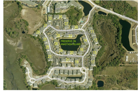
Built in 2000 - 328 units - 2 floors

Management Company for The Preserve on Anastasia Island Condominium 661 A1A Beach Blvd. St. Augustine Beach, FL 32080 (904) 471-5818 Office (904) 471-7441 Fax http://staugpreserve.com/