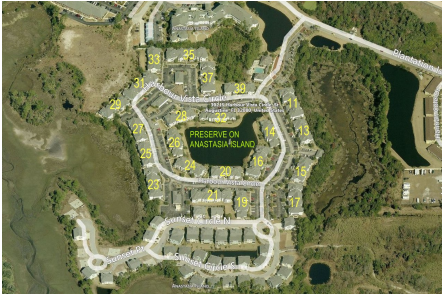
Built in 2000 - 328 units - 2 floors

Management Company for The Preserve on Anastasia Island Condominium 661 A1A Beach Blvd. St. Augustine Beach, FL 32080 (904) 471-5818 Office (904) 471-7441 Fax http://staugpreserve.com/