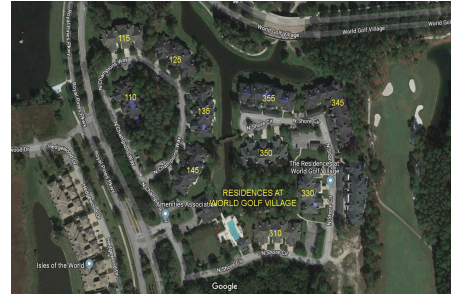
Built in 1998/2005 - 78 units - 3 floors