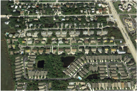
Built in 1983 - 93 units - 1 floor

Rio Del Mar Condominium No One Association Inc 1845 Old Moultrie Road Saint Augustine, FL 32080 Phone: (904) 826-3302