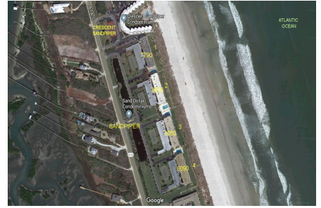
Built in 1982 - 166 units - 6 floors

Sand Dollar Condominiums St Augustine Address: 3942 A1A S, St Augustine, FL 32080 Phone: +1 800-587-2287 http://www.sanddollarfl.com/index.html