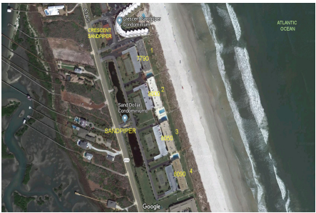
Built in 1982 - 166 units - 6 floors

Sand Dollar Condominiums St Augustine Address: 3942 A1A S, St Augustine, FL 32080 Phone: +1 800-587-2287 http://www.sanddollarfl.com/index.html