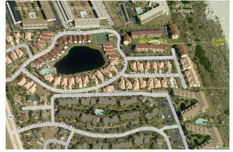
Built in 1985 - 78 units - 3 floors

Sea Place Homeowners Association 4400 A1A S, St Augustine, FL 32080 (904) 471-4925