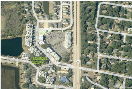
Built in 2006 - 40 units - 2 floors

SEAGROVE CONDOMINIUM OWNERS' ASSOCIATION, INC JACOBS AND ASSOCIATES, INC. 461 A1A BEACH BLVD SAINT AUGUSTINE FL 32080 PHONE 904-461-5556