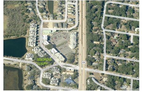
Built in 2006 - 40 units - 2 floors

SEAGROVE CONDOMINIUM OWNERS' ASSOCIATION, INC JACOBS AND ASSOCIATES, INC. 461 A1A BEACH BLVD SAINT AUGUSTINE FL 32080 PHONE 904-461-5556