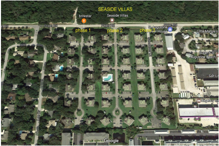
Built in 2006 - 164 units - 2 floors

Seaside Villas on Anastasia Island 30 Clipper Court St. Augustine Beach, FL 32080 p: (904) 471-0065 f: (904) 471-9015 http://www.psdm-seasidevillas.com/Apartments/module/home/is_full_version/1/