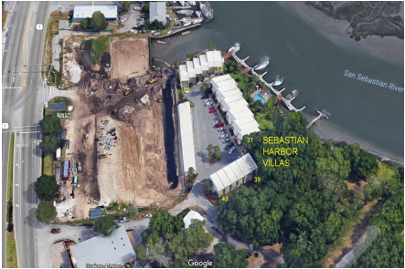
Built in 1986 - 24 units - 3 floors