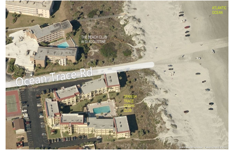
Built in 1973 - 60 units - 4 floors

Spanish Trace Ocean Club Address: 1 Ocean Trace Rd, St Augustine Beach, FL 32080, Phone:+1 904-471-2535 http://spanishtrace.com/