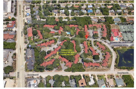
Built in 1980 - 121 units - 2 floors

Number of units: 121 Number of active listings for rent: 0 Number of active listings for sale: 0 Building inventory for sale: Number of sales over the last 12 months: 0% Number of sales over the last 6 months: 0 Number of sales over the last 3 months: 0