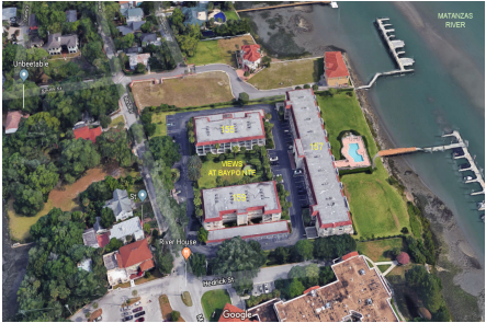
Built in 2001 - 58 units - 3 floors

The Views At Bay Pointe Condominium Association Address 159 Marine St, Unit 203 Saint Augustine, Florida 32084 Phone +1 904-824-0188