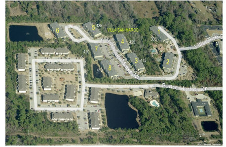
Built in 2004 - 178 units - 3 floors

VILLA SAN MARCO CONDOMINIUM ASSOCIATION, INC 1637 RACE TRACK RD # 206 ST JOHNS FL 32259 PHONE 904-561-9708 FAX 904-461-0335