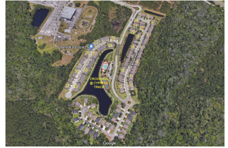
Built in 2008 - 208 units - 2 floors