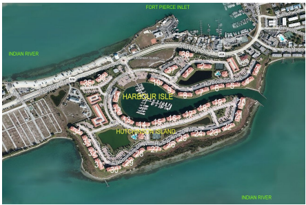
Built in 2005 - 288 units - 4 floors

HARBOUR ISLE EAST Condominium Association Bristol Management Services, Inc. 1930 Commerce Lane, Suite 1 Jupiter, FL 33458 (772) 595-3660 http://www.harbourisleeast.org/