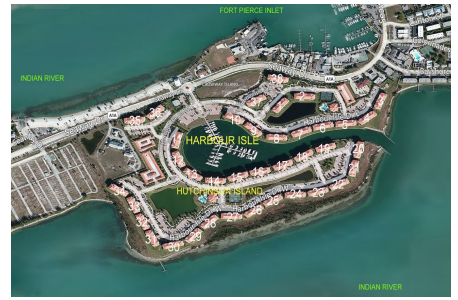
Built in 2005 - 288 units - 4 floors

HARBOUR ISLE EAST Condominium Association Bristol Management Services, Inc. 1930 Commerce Lane, Suite 1 Jupiter, FL 33458 (772) 595-3660 http://www.harbourisleeast.org/