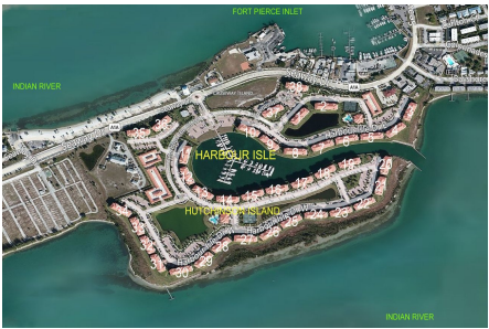
Built in 2005 - 624 units - 4 floors

Managed By Elliott-Merrill Community Management office address 14-A Harbour Isle Drive West Fort Pierce, FL 34949 (772) 466-5512 http://www.harbourislewest.com/index.php