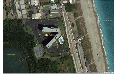
Built in 1983 - 110 units - 12 floors

Sea Pointe Towers Of Ft Pierce 801 S Ocean Drive # 101 Fort Pierce, FL 34949 - map (772) 465-8206