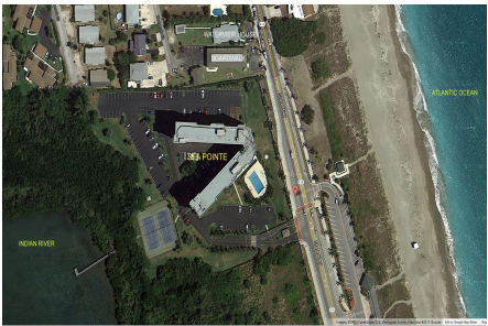
Built in 1983 - 110 units - 12 floors

Sea Pointe Towers Of Ft Pierce 801 S Ocean Drive # 101 Fort Pierce, FL 34949 - map (772) 465-8206