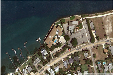
Built in 1982 - 27 units - 3 floors