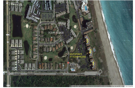
Built in 2003 - 72 units - 4 floors

Southpointe At Ocean Village Homeowners Association 2400 South Ocean Drive, Hutchinson Island, Ft Pierce, FL 34949-8018 http://www.oceanvillage.com/index.cfm?ID=193