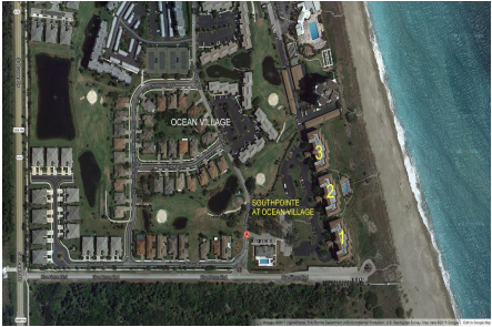
Built in 2003 - 72 units - 4 floors

Southpointe At Ocean Village Homeowners Association 2400 South Ocean Drive, Hutchinson Island, Ft Pierce, FL 34949-8018 http://www.oceanvillage.com/index.cfm?ID=193