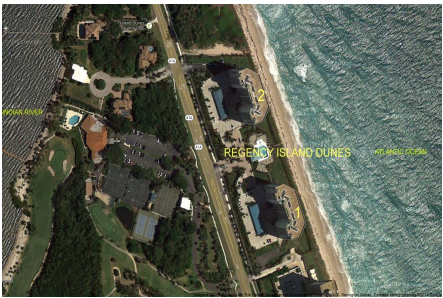
Built in 1966 - 70 units - 13 floors

REGENCY ISLAND DUNES ASSOCIATION INC 8640 S OCEAN DR JENSEN BEACH, FL 34957-2109 (772) 229-0311 http://www.regencyislanddunes.com/