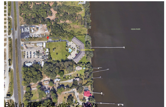
Built in 1984 - 24 units - 2 floors