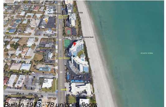
Built in 1973 - 78 units - 8 floors