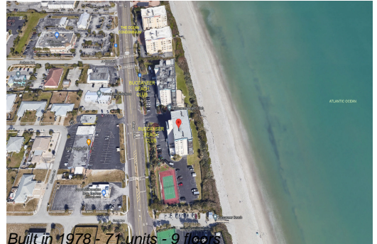
Built in 1978 - 71 units - 9 floors