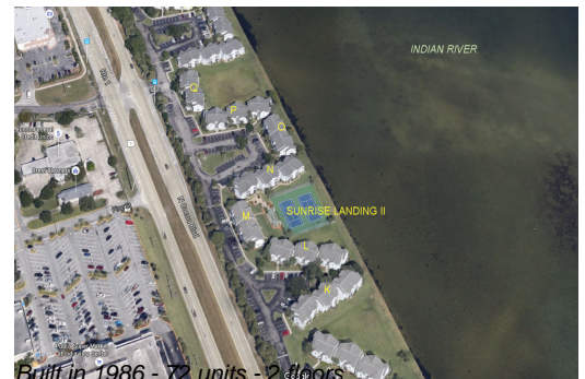
Built in 1986 - 72 units - 2 floors