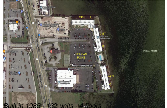
Built in 1985 - 132 units - 4 floors