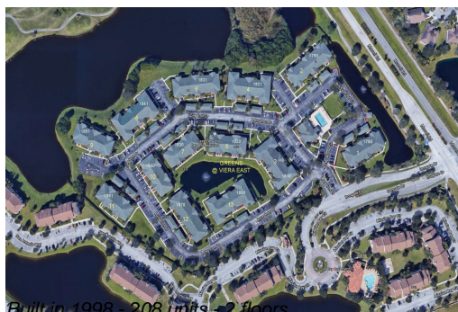
Buildin 1998 - 208 units - 2 floors