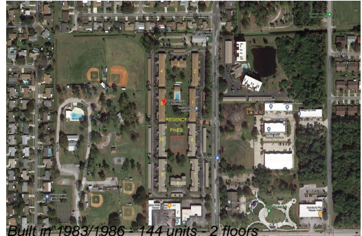
Built in 1983/1986 - 144 units - 2 floors