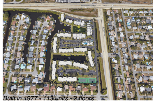
Built in 1977 - 113 units - 2 floors