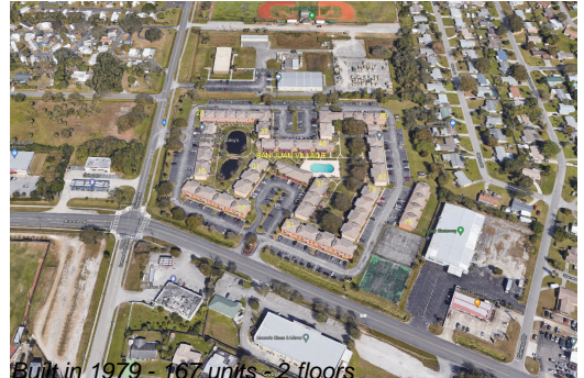
Built in 1979 - 167 units - 2 floors