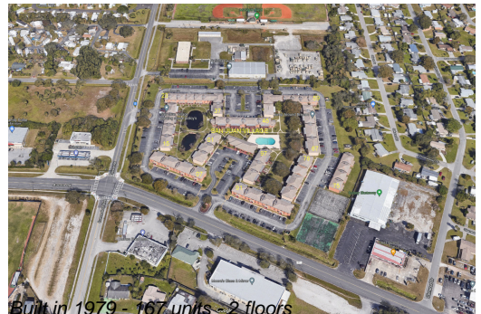
Built in 1979 - 167 units - 2 floors