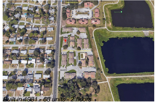
Built in 1981 - 68 units - 2 floors