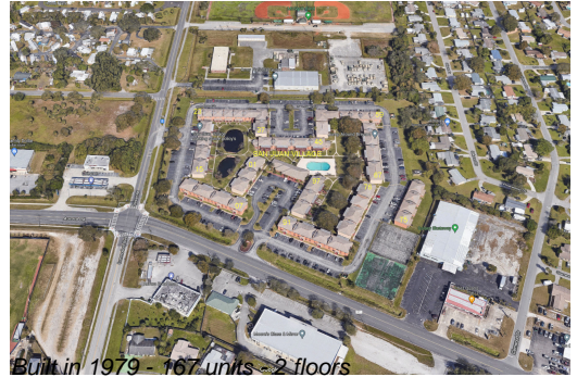
Built in 1979 - 167 units - 2 floors