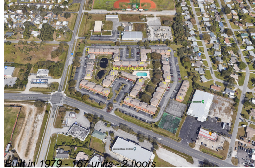
Built in 1979 - 167 units - 2 floors