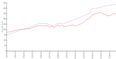
Serena Shores 1965 (North) vs Indian Harbour Beach