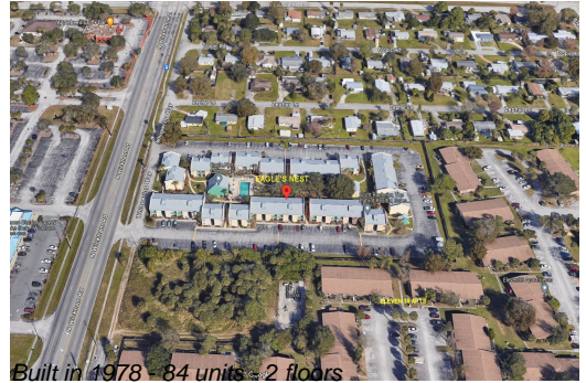
Built in 1978 - 84 units - 2 floors