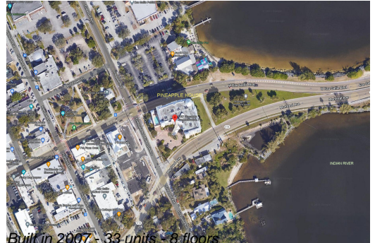
Built in 2007 - 33 units - 8 floors