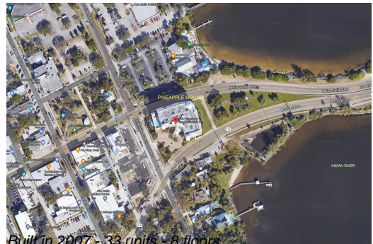
Built in 2007 - 33 units - 8 floors