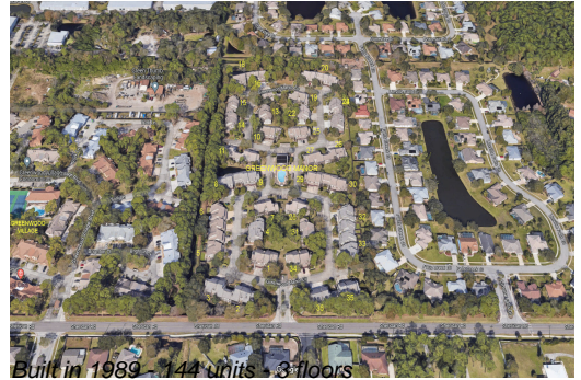
Built in 1989 - 144 units - 3 floors