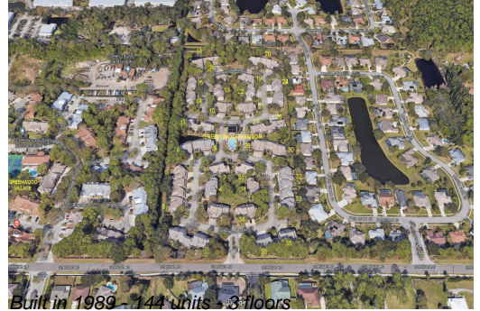
Built in 1989 - 144 units - 3 floors